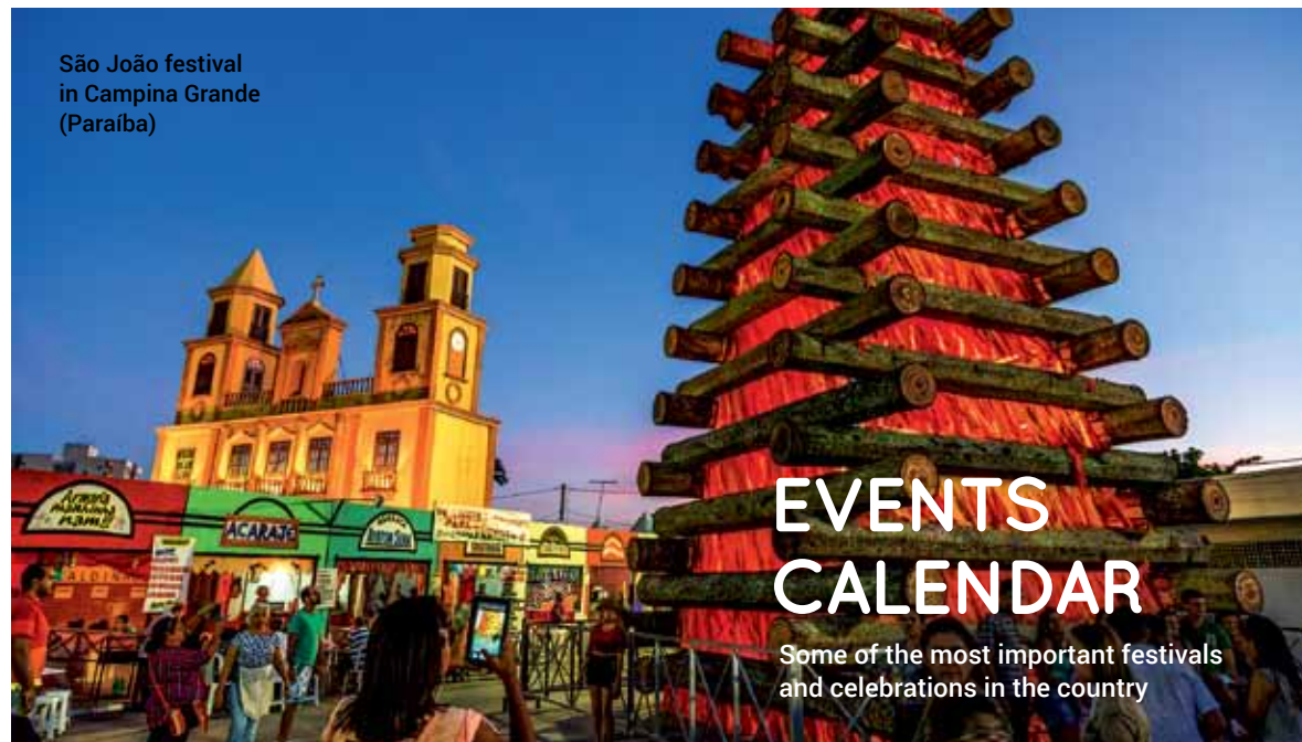
São João festival in Campina Grande (Paraíba)