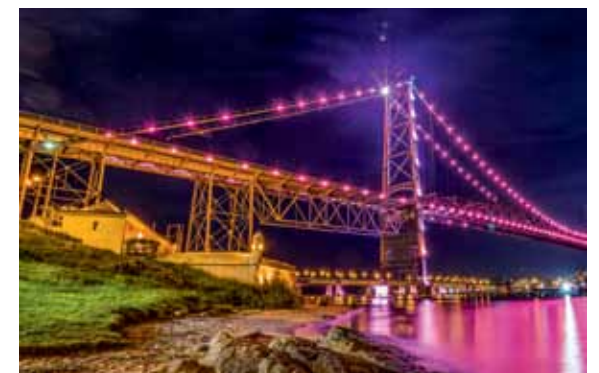
Ubatuba (São Paulo); Teatro Amazonas, Manaus (Amazonas); beijupirá fish (Pernambuco); Hercílio Luz Bridge, Florianópolis (Santa Catarina)